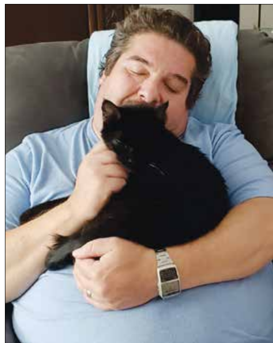
Oscar and Felix love to cuddle with their humans on the couch and always be the center of attention!