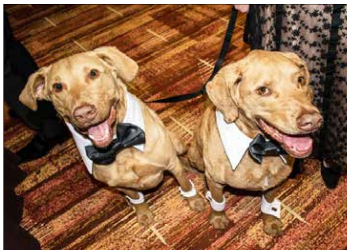
Canines are the "Guests of Honor" at our Black Tie & Tails Fundraising Gala and we can't wait to see them all again!

being able to return to a shotgun start and awards dinner. This year was another sold-out event with prizes galore and our best-ever online auction! We wish to thank all of our golfers, donors, bidders, all of the folks at Schaffer's Mill and our wonderful volunteers, especially our dedicated Golf Committee. Keep an eye out for our 2022 Save the Date, you won't want to miss registration next year.