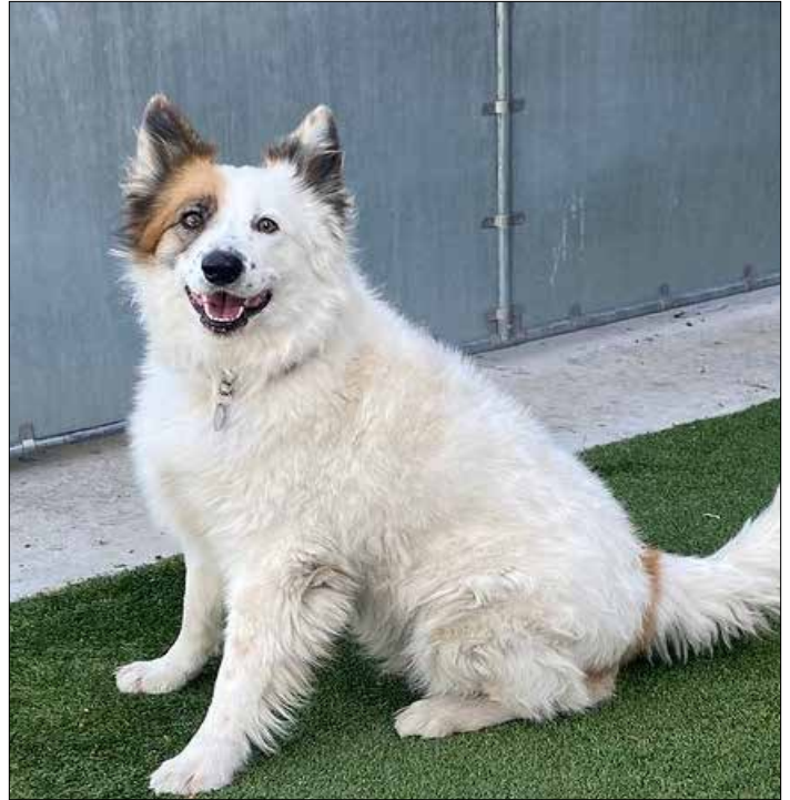
From day one, Kodi's sweet-natured spirit shined through, making him a favorite of staff and volunteers alike.

Once he was available for adoption, interest came pouring in. Soon, Kodi had an appointment to meet his potential new family and new fur brother, Sammy. Sammy's parents were a young, active couple who were looking to add a new