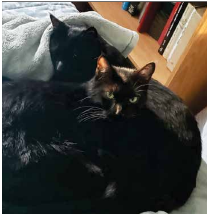
Bonded pairs, like Felix & Oscar, are often easier to adopt as they have a built in play partner to keep them from getting bored and a snuggle buddy to keep them company.

Felix and Oscar's new family have set up a jungle gym for the cats in their home. Their philosophy was "bringing the outdoors indoors". With climbing structures on the walls throughout the home, Oscar and Felix have countless hours of playing tag with each other. They love to watch the days pass by each other's side.