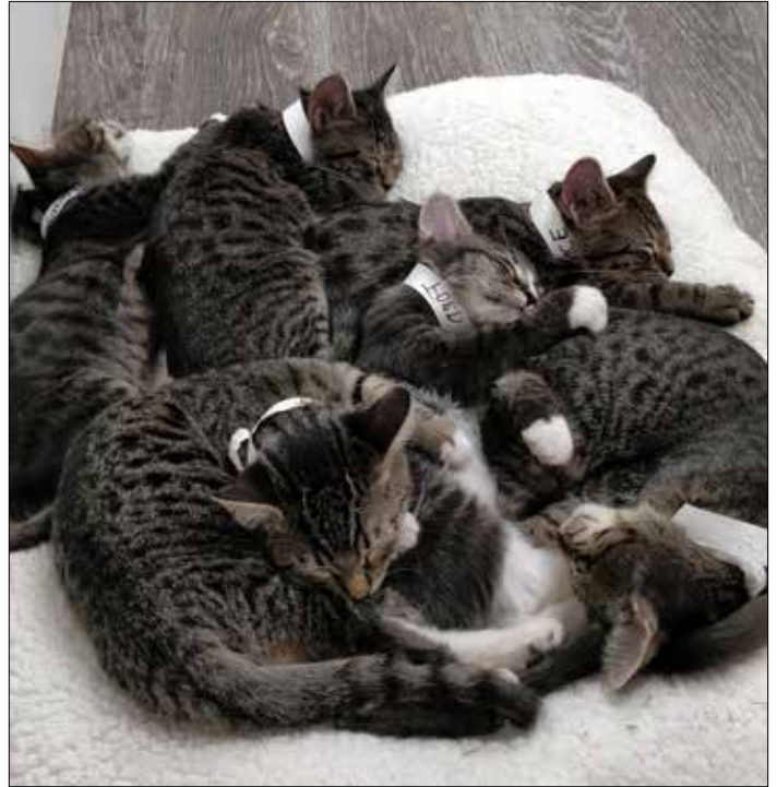
Talk about an adorable cuddle puddle! All of these kittens, and many more, were socialized, cared-for and loved by our dedicated cat care volunteers in South Lake Tahoe.

after some quality time with our patient volunteers,