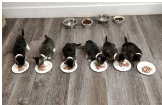
Feeding and cleaning up after six kittens takes some time, not to mention the time spent playing and cuddling over 40 cats and kittens over the last two years!

We couldn't have done it without our cadre of wonderful South Lake Tahoe volunteers.