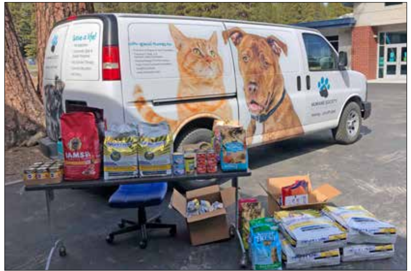
Quarantines, loss of wages and lack of inventory/access to essential items are having huge impacts on our community members and their pets. With that in mind, we are operating an expanded version of our Pet Pantry program, providing pet food and supplies.

HSTT is able to help stop unwanted litters from adding to the homeless pet population. Since the onset of the pandemic in March 2020 HSTT has provided 468 low-cost or free surgeries to pets belonging to community members in the area.