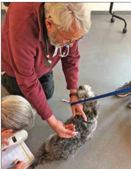
The pandemic halted Wellness Clinics in early 2020, increasing demand for these services in 2021. So far we've treated 136 pets through our clinics this year.

We offer low-cost spay/neuter surgeries and vouchers for dogs and cats, to income-qualifying community members in our coverage area. Through the spay/neuter clinic at the shelter and partnerships with Veterinarians in our region,